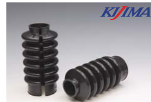
FRONT FORK BOOTS "EASY ON" for 39mm (KIJ0100) sold in pairs comes with cable ties(Lx2, Sx2) *it may not fit long fork chopper or front lowered bikes.

These boots feature cut body for easy installation.