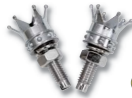
CROWN LICENSE BOLTS chrome (MN012CH) sold in pairs