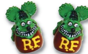
Rat Fink VALVE CAPS (MN035) sold in pairs