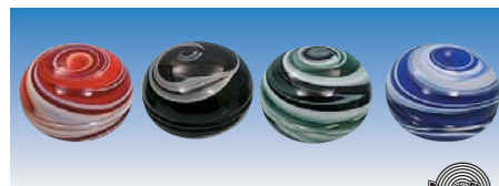
MARBLE SHIFT KNOB red/white (PSY004RD) black/white (PSY004BK) green/white (PSY004GR) blue/white (PSY004BL) glass fitting thread: 5/16inch-24 size: height:39mm x width: 51.5mm *these knobs are hand-made, every each one is little different designs

These boots feature cut body for easy installation.