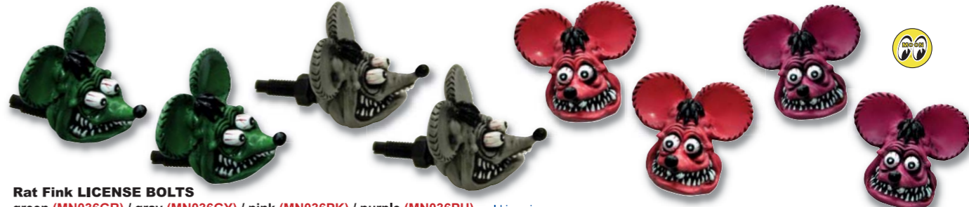
Rat Fink LICENSE BOLTS green (MN036GR) / gray (MN036GY) / pink (MN036PK) / purple (MN036PU) sold in pairs