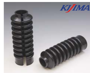
FRONT FORK BOOTS "EASY ON" for 41mm (KIJ0101) sold in pairs comes with cable ties(Lx2, Sx2) *it may not fit long fork chopper or front lowered bikes.