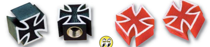
MALTESE CROSS VALVE CAPS black (MN005BK) / red (MN005RD) sold in pairs