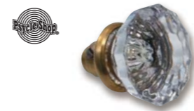
GLASS SHIFT KNOB (PSY003) body: glass mounting: brass fitting hole: 8mm dia. size height: 58mm / width: 52.5mm