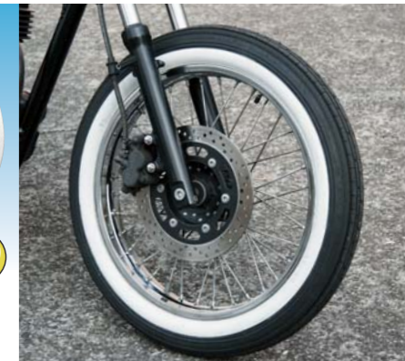
WHITE RIBBON for 16inch (MN033-16) for 17inch (MN033-17) for 18inch (MN033-18) (width:32mm) for 18inch (MN033S18) (width:22mm) for 19inch (MN033-19) fits between tire and rim *sold each (needed 4pcs for 2-wheels)