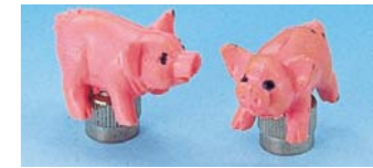
HOG VALVE CAPS (9504) sold in pairs