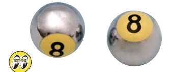
8BALL VALVE CAP chrome (MN009CH) sold in pairs