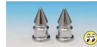
SPIKE VALVE CAPS chrome (MN013CH) sold in pairs