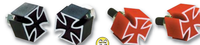
MALTESE CROSS LICENSE BOLTS black (MN006BK) / red (MN006RD) sold in pairs