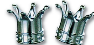
CROWN VALVE CAPS (MN011CH) sold in pairs